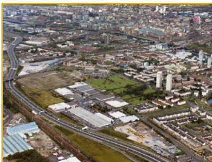
CLOSE TO GLASGOW CITY CENTRE