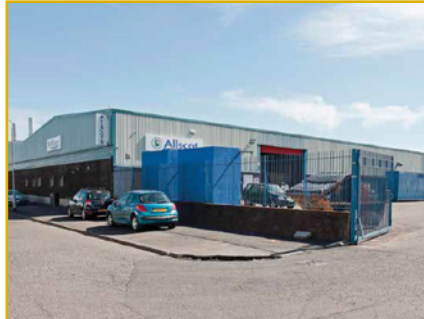
SECURE YARD COMPLEX