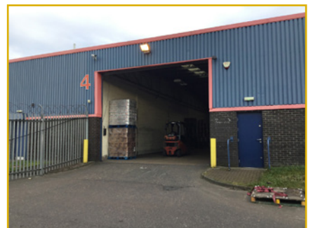
LARGE LOADING DOORS